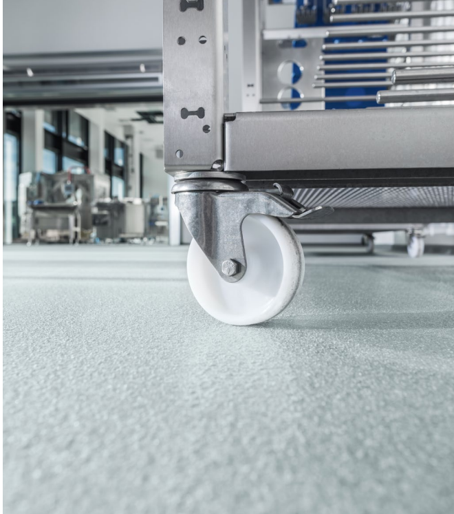
Slip-resistance achieved by scattering with quartz sand.